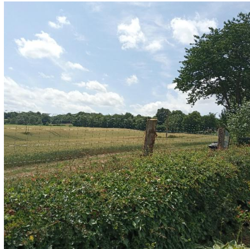
Photo from my roof showing poles very proud over my hedge but hidden from view in gardens to left as land slopes sharply away in field behind them. All our rear hedges are the same height and would act as the same deterrent to deer if they could access the rear of our properties, which they cannot and have not in the 50 years I have lived here.